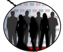
PHOTO STATION PARTNER